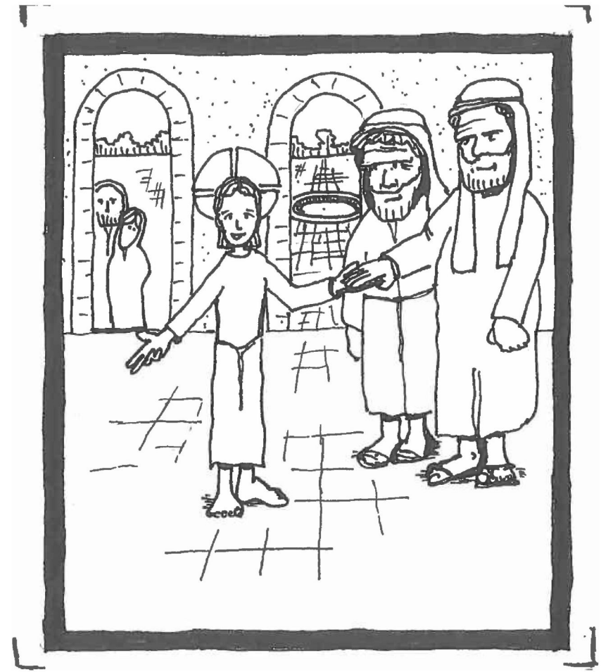
THE FINDING OF JESUS IN THE TEMPLE LUKE 2:46 PIETY